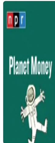
Planet Money NPR