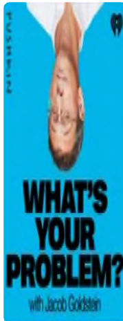
What's Your Probl... iHeartPodcasts and...