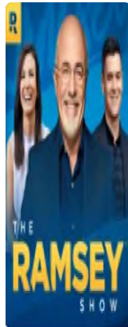
The Ramsey Show Ramsey Network